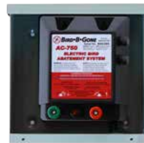
Install Direct Plug-in Charger in Weatherproof Box